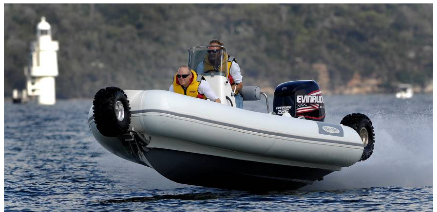
"Propwalking" on Sydney Harbour with Sealegs

By our exposure to the New Zealand and Australian manufacturing sector, we are constantly reminded of the ingenuity available in this part of the world. In this issue, we highlight some of the innovation available.