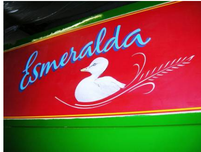
No chance to duck your responsibilities under the RCD.

The RCD states that the "normal life" of an engine is 10 years. Very soon, boats missing their CE marks will be required to replace their engine(s) to earn their CE mark. Be warned: don't delay!