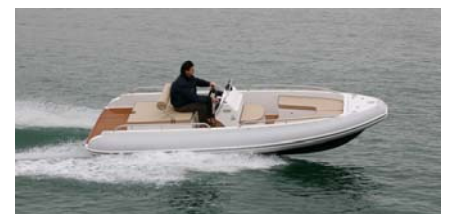
The McMullen & Wing 570