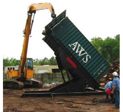
A WARD Attachments Ltd can be contacted on +649 622 3111.